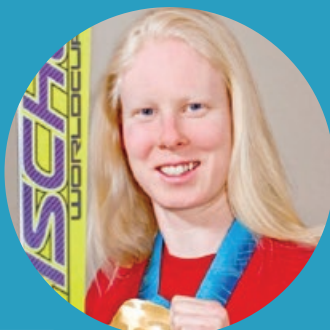
Viviane Forest Gold Medalist - Alpine Skiing & Goal Ball