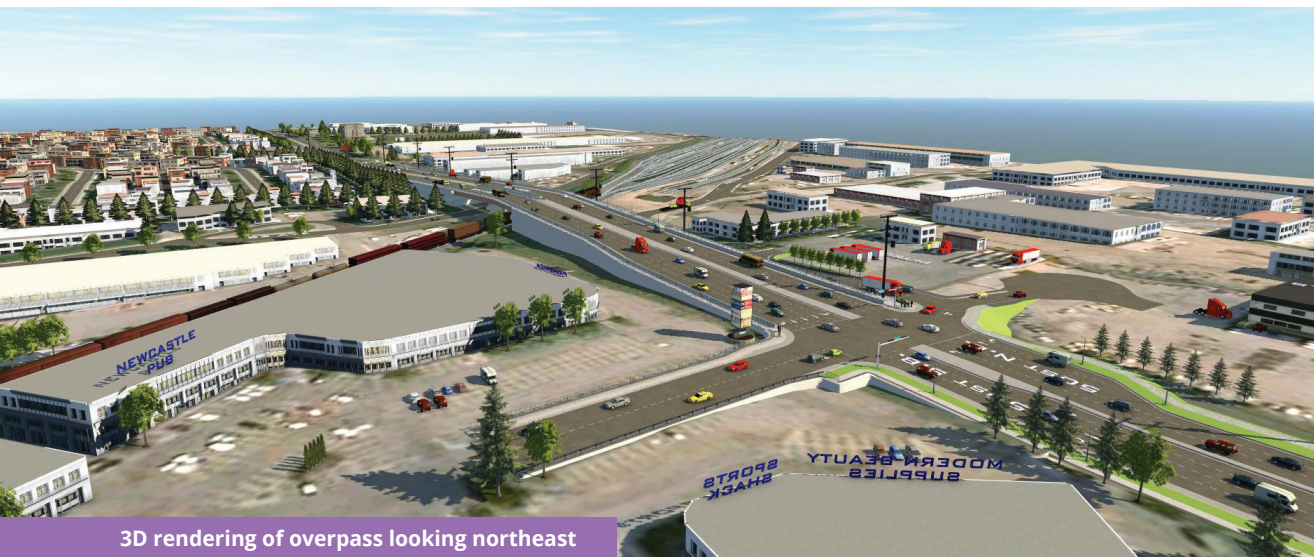
3D rendering of overpass looking northeast