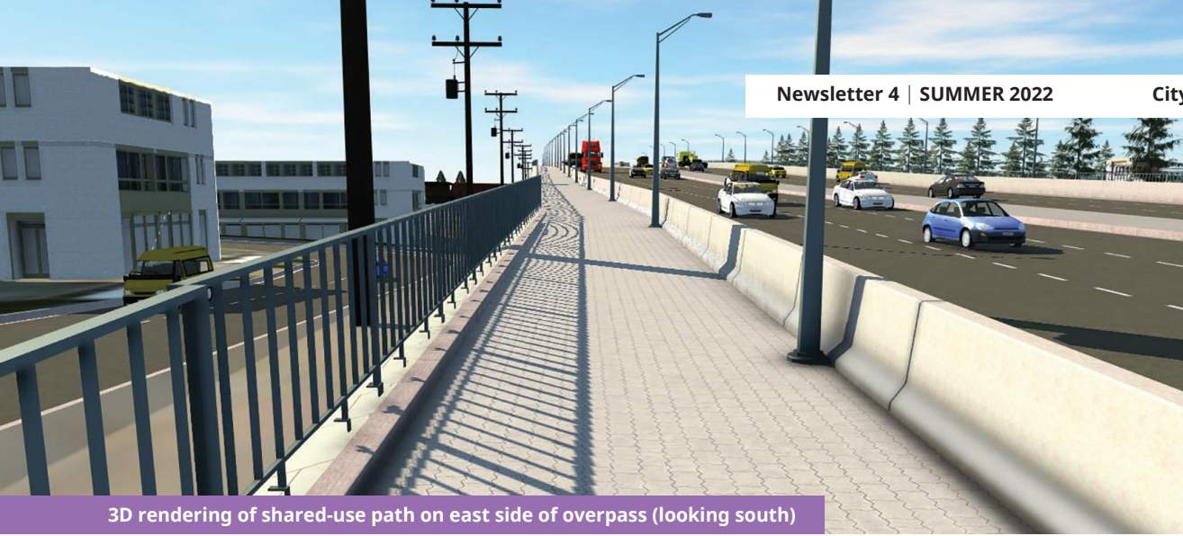
3D rendering of shared-use path on east side of overpass (looking south)