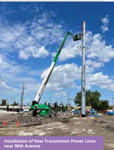
Installation of New Transmission Power Lines near 90th Avenue

Construction on the 50 Street Widening and Railway Grade Separation project began in the spring. In 2022, crews relocated various underground and overhead utility lines (EPCOR Water, EPCOR Transmission, EPCOR Distribution, ATCO Gas, ATCO Pipelines, Shaw, and Telus), built retaining walls to support the overpass and completed drainage work. In November, work on the northbound overpass structure began and is anticipated to be completed in 2024. Following the opening of the northbound overpass, work will begin on the southbound overpass structure, which is anticipated to be completed by the end of 2025. The entire overpass will be fully operational in 2026.