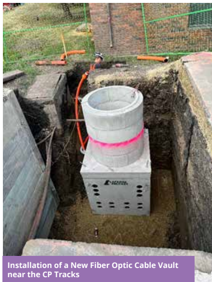
Installation of a New Fiber Optic Cable Vault near the CP Tracks