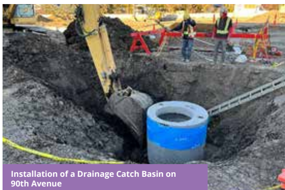
Installation of a Drainage Catch Basin on 90th Avenue