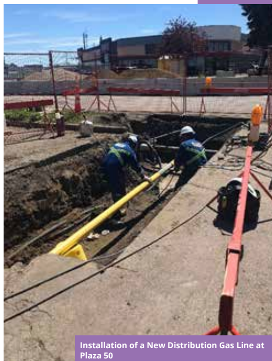
Installation of a New Distribution Gas Line at Plaza 50