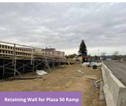
Retaining Wall for Plaza 50 Ramp