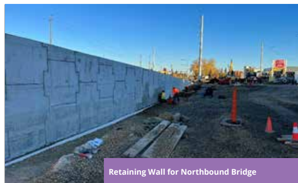
Retaining Wall for Northbound Bridge