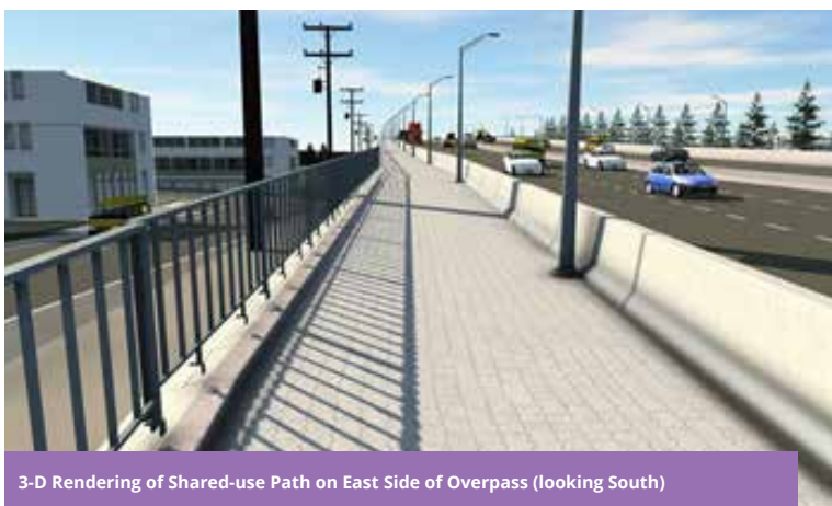
3-D Rendering of Shared-use Path on East Side of Overpass (looking South)