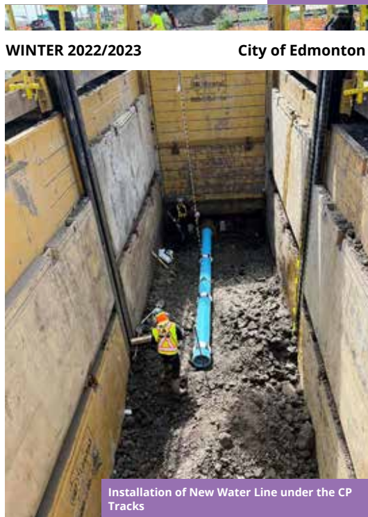
Installation of New Water Line under the CP Tracks