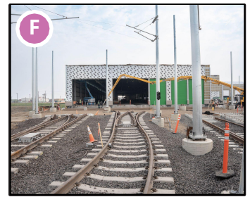
Area 9 - Gerry Wright OMF-B Exterior Track Work