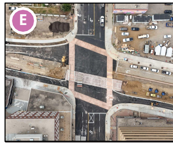
Area 3 - Accelerated Roadwork at Stony Plain Road & 124 Street