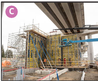
Area 6 - WEM Station Construction