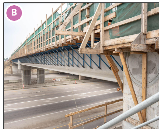
Area 7 - Anthony Henday Drive LRT Bridge Construction