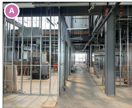
Area 8 - Lewis Farms Storage Facility Interior Work

In Q2 2025 , the first LRV was being readied for shipping by the end of June. City and CTP staff visited Korea to discuss testing and commissioning with HRC and to witness testing and LRV moving.