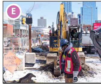
Area 2 - Drainage work progresses along 104 Ave