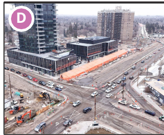
Area 3 - Grovenor Stop Construction