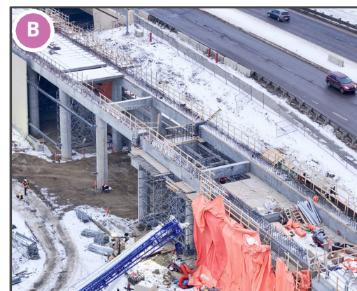
Area 7 - Anthony Henday Drive LRT Bridge Construction