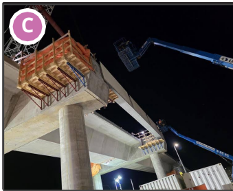
Area 6 - Misericordia Station box girder installation