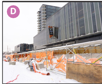
Area 4: Grovenor/142 Street Stop Construction Progress