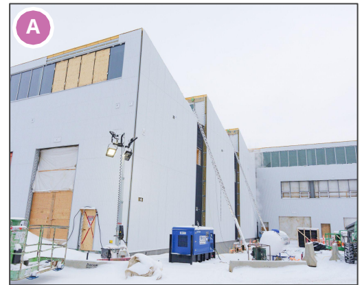
Area 8 - Lewis Farms Storage Facility Construction

A total of seven light rail vehicles (LRV) are in manufacturing phase.