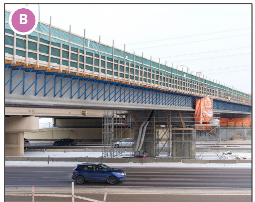
Area 7: Anthony Henday Drive LRT Bridge Construction