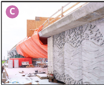
Area 6: Elevated Guideway Art Panels