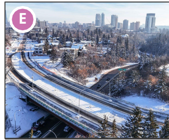
Area 3: Stony Plain Road Bridge Opened to Traffic on November 30