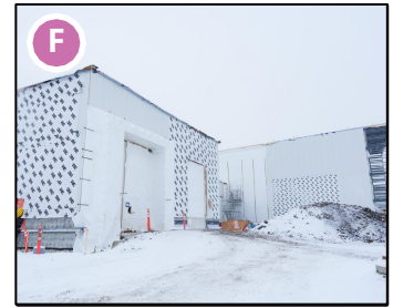
Area 9: Gerry Wright OMF-B Wall Insulation