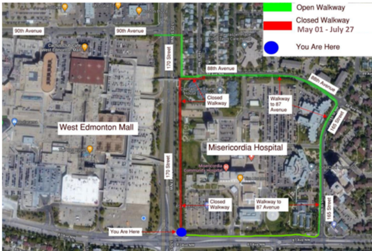
Figure 2 - Pedestrian detour route map (signage will be posted at all turn locations for ease of use).