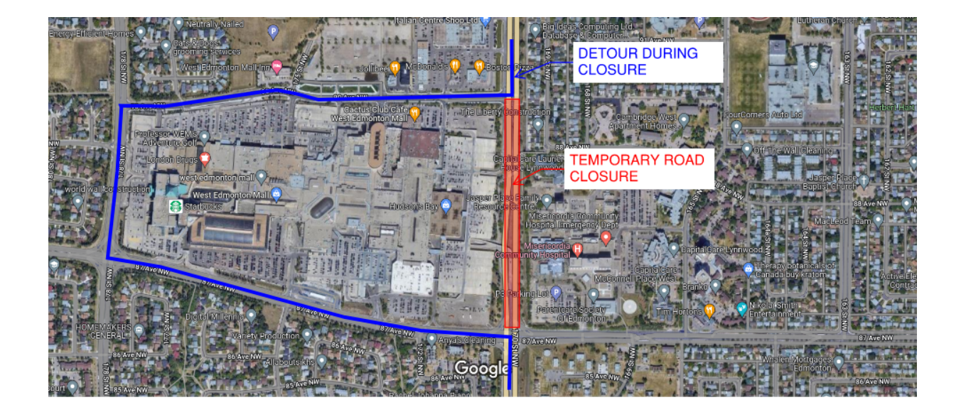
Figure 1 – 170th Street temporary road closures - Red indicates the temporary closure area and blue

INTEGRATED INFRASTRUCTURE SERVICES TRANSPORTATION INFRASTRUCTURE DELIVERY CITY OF EDMONTON