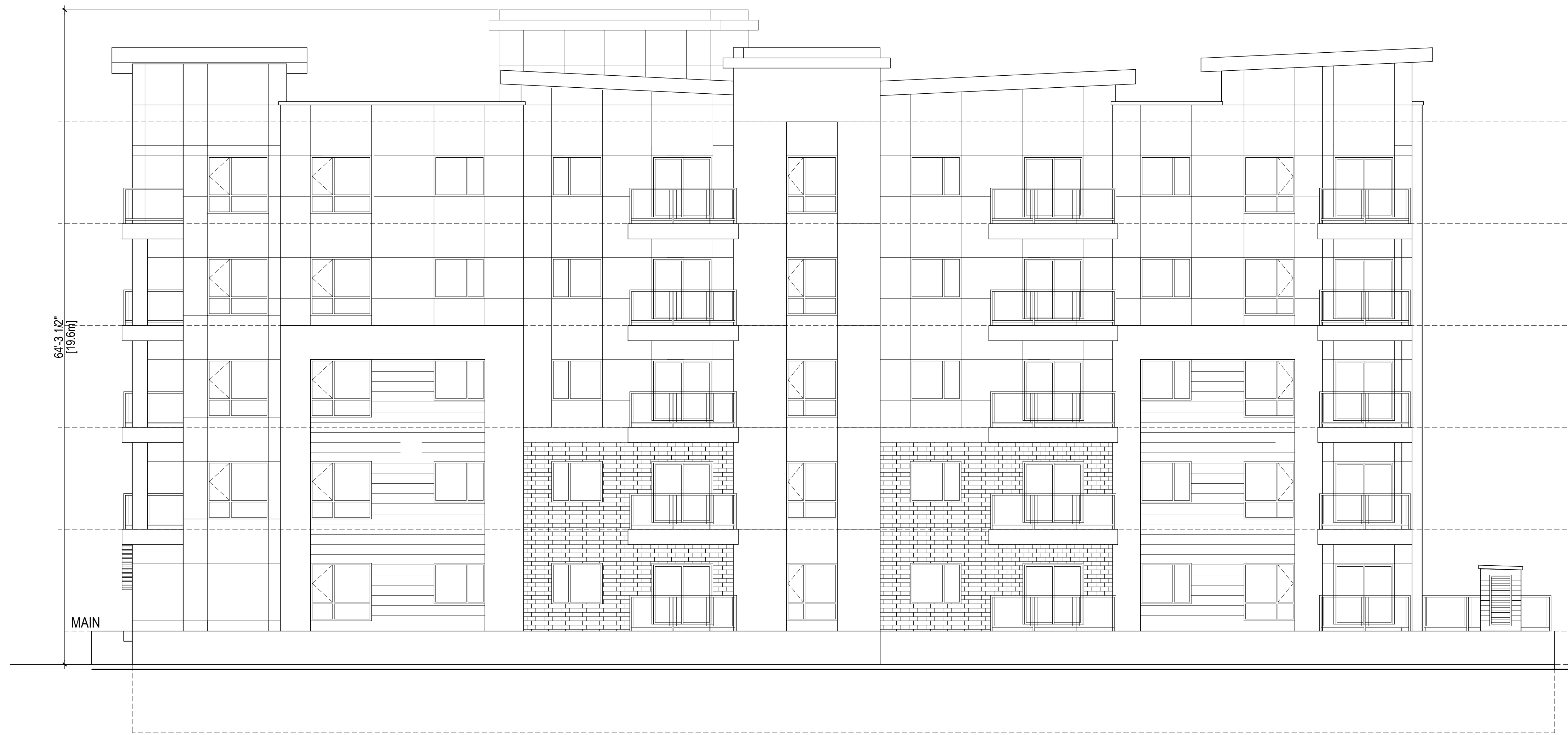
APPENDIX-4 WEST ELEVATION