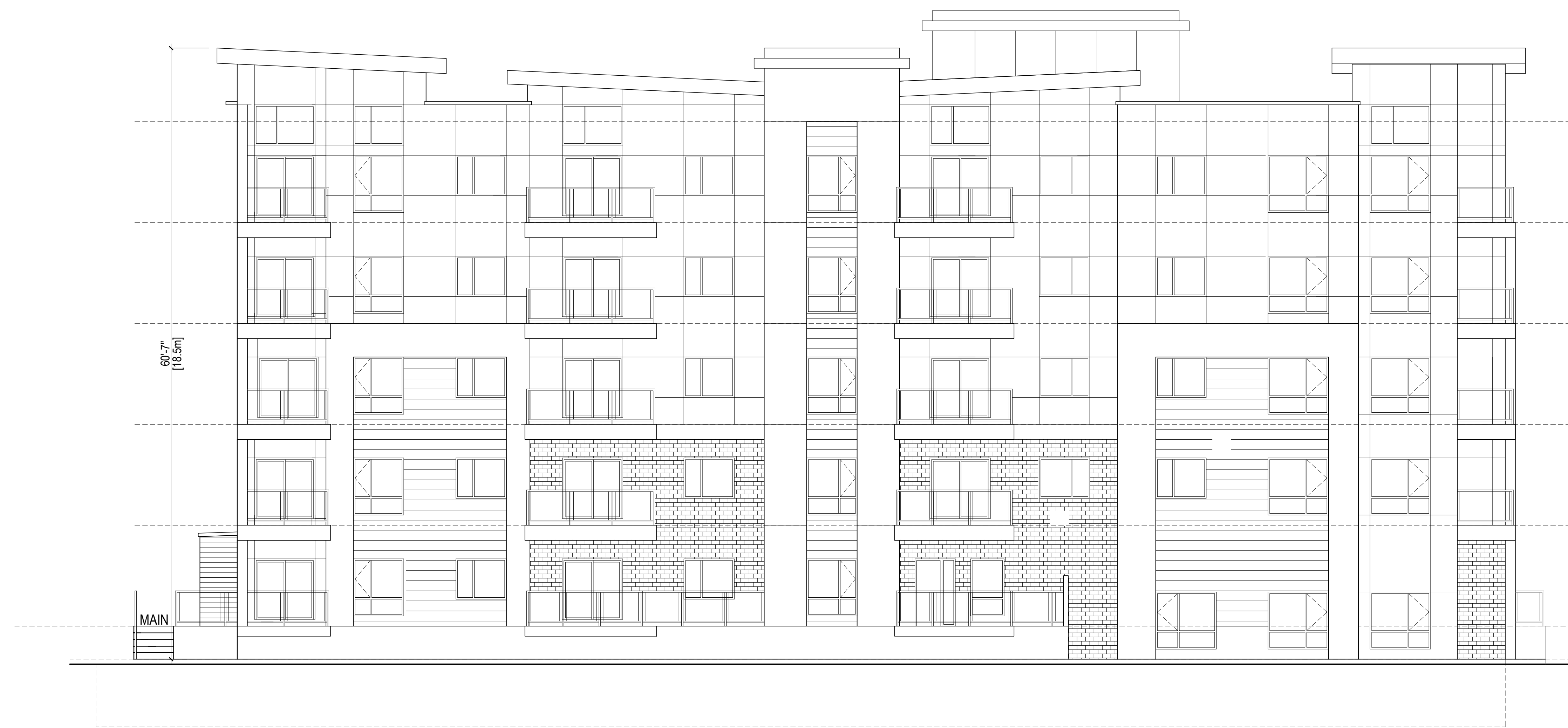
APPENDIX-5 EAST ELEVATION