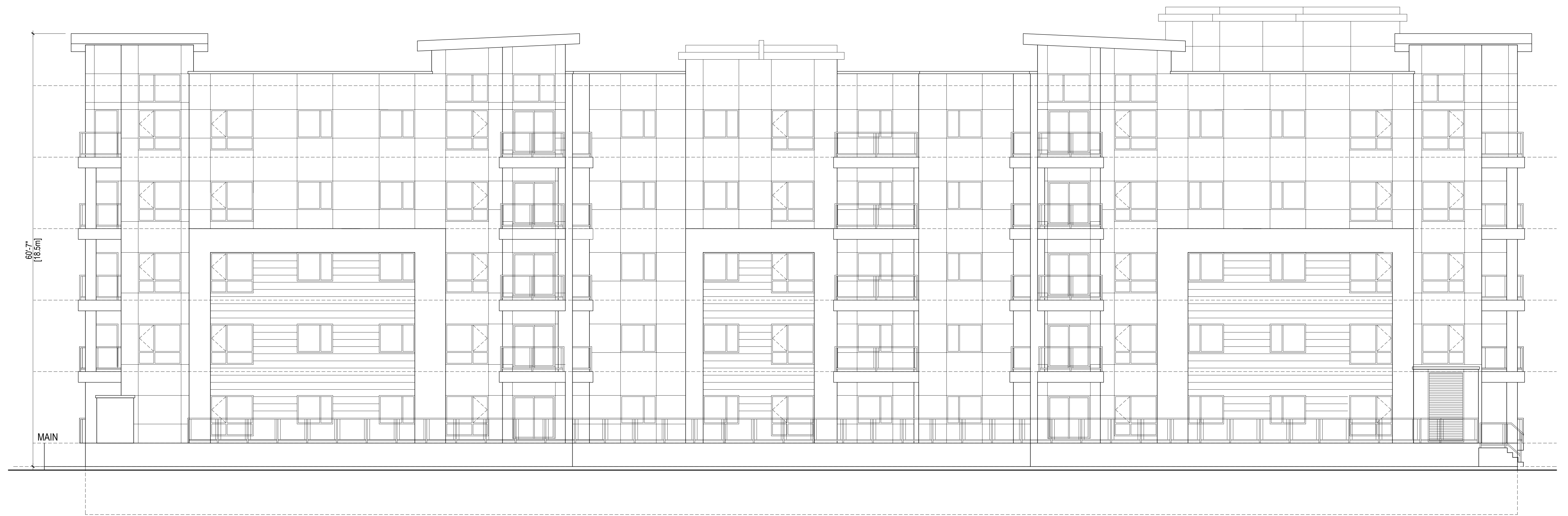
APPENDIX-3 SOUTH ELEVATION