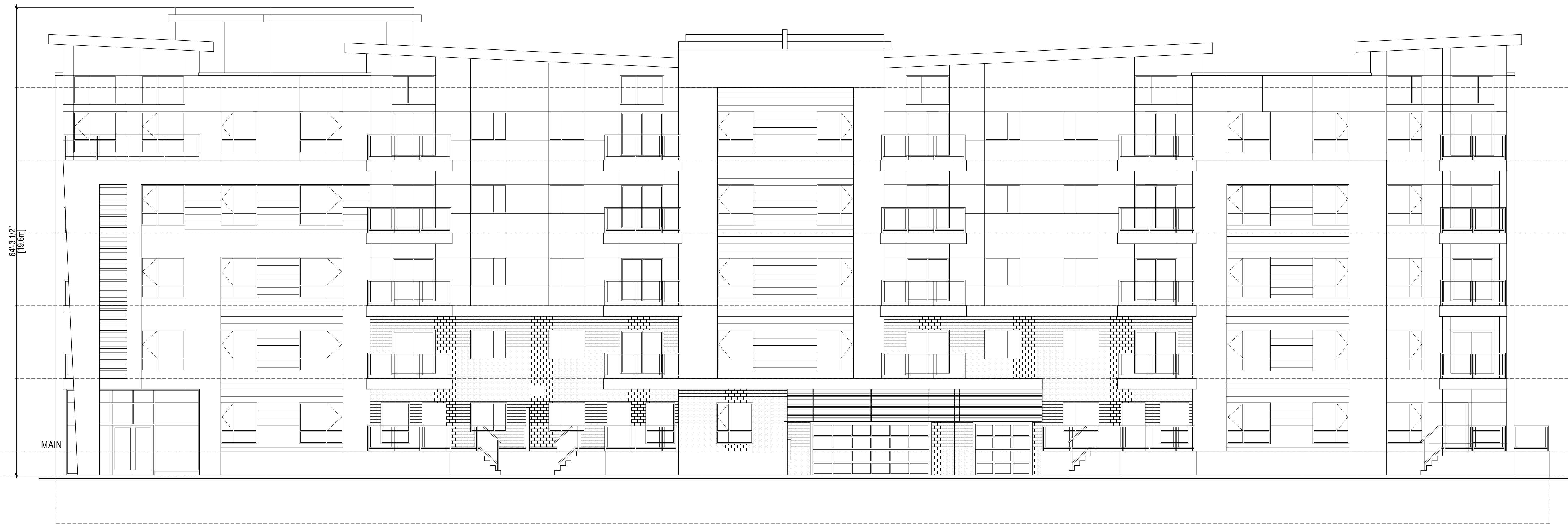
APPENDIX-2 NORTH ELEVATION