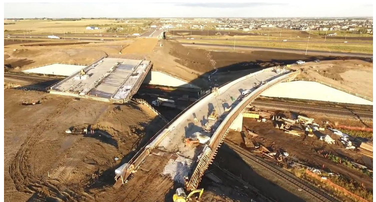
Looking west at 41 Avenue SW