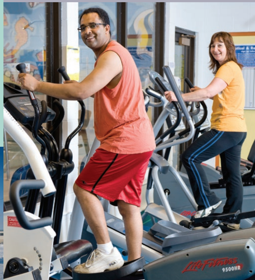
Jasper Place Fitness and Leisure Centre

There are 1,440 minutes in a day, schedule 30 of them for walking!