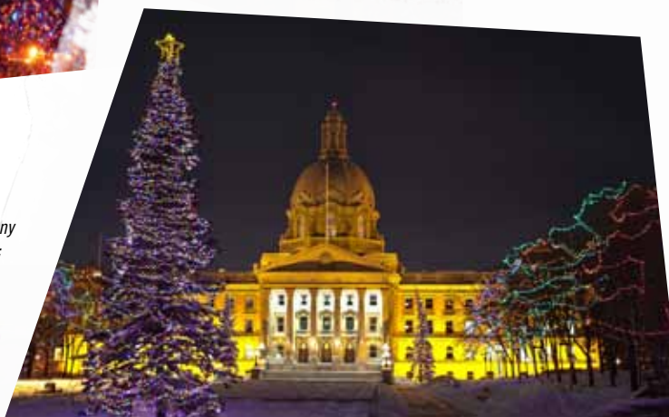
PHOTO CREDITS (Clockwise from top right): Symphony Under the Sky, Courtesy of Symphony Under the Sky ; Celebrate the Season, Courtesy of the Alberta Legislative Assembly Office ; Christmas on the Square Holiday Light Up, Courtesy of City of Edmonton