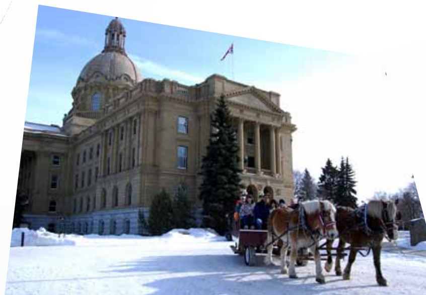
Global Visions Film Festival ; Winterfête ; Canadian Birkenbeiner Ski Festival