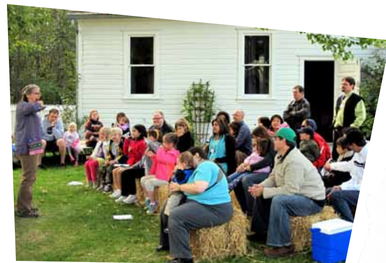
PHOTO CREDITS (Clockwise from top right): Kaleido Family Arts Festival, Edward Allen Photography ; Tour of Alberta: Canada's Pro-Cycling Race and Festival, John Pierce - PhotoSport International uk usa asia ; TALES Fort Edmonton Storytelling Festival, Tracy Kolenchuk

Edmonton International Film Festival is a celebration of international, independent, eye-opening films. Meet visiting filmmakers and actors, create a film in just 24 hours, sample 150 films curated from around the world and... walk the red carpet.