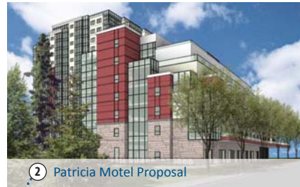
2 Patricia Motel Proposal