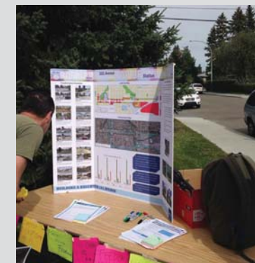
JULY AND AUGUST - POP-UP ENGAGEMENT