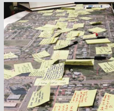
JUNE 21 - COMMUNITY WORKSHOP