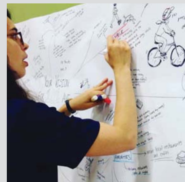
JUNE 21 - COMMUNITY WORKSHOP