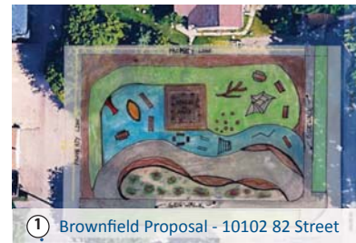
1 Brownfield Proposal - 10102 82 Street