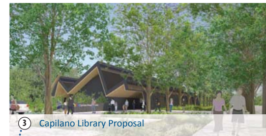
3 Capilano Library Proposal