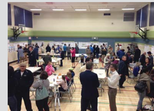
SEPTEMBER 29 - OPEN HOUSE