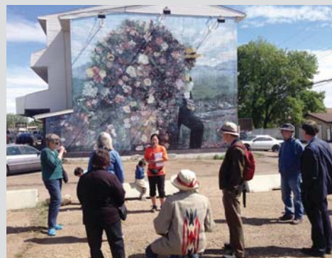
MAY 7 AND 8 - JANE'S WALKS ON 101 AVE THESE WERE LED BY THE COMMUNITY ON MAY 7 AND 8. NEARLY 50 PEOPLE (PLUS A FEW DOGS) CAME OUT TO WALK 101 AVENUE AND DISCUSS THE CORRIDOR'S CHALLENGES AND OPPORTUNITIES TOGETHER.