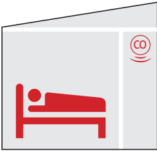
sleeping areas = CO alarms