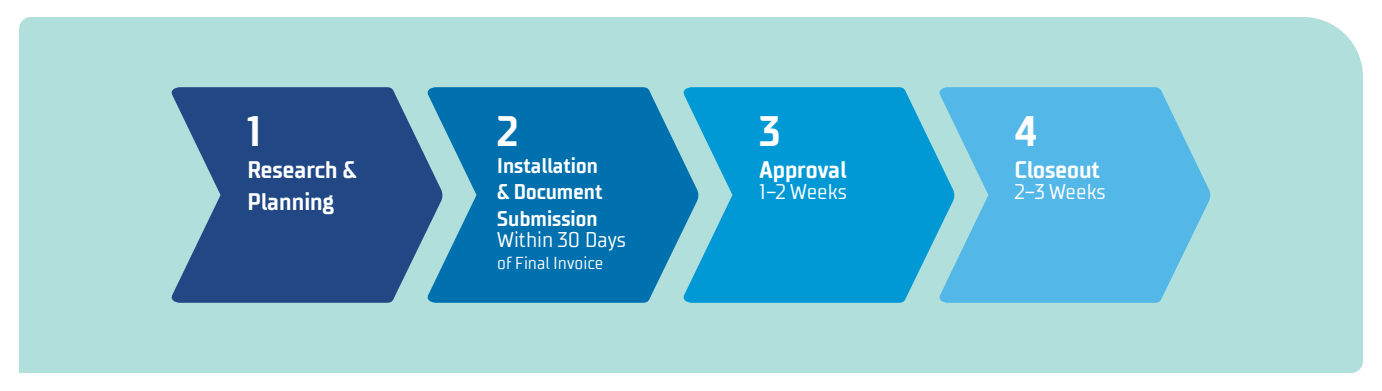
FIGURE 2: POST-INSTALLATION APPLICATION PROCESS

Refer to the Program Checklist to help guide you through your application process.