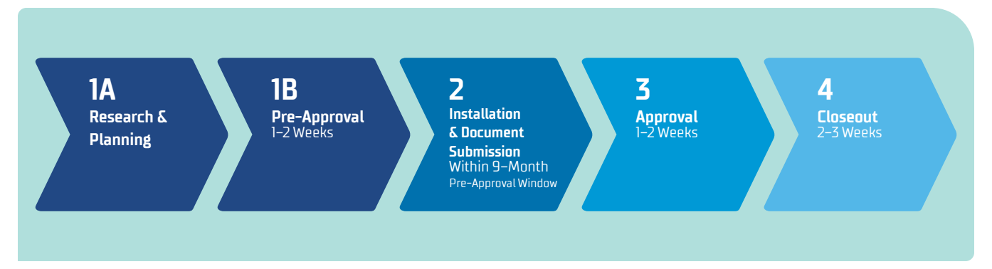
FIGURE 1: PRE-APPROVAL APPLICATION PROCESS

A rebate cheque will be sent to the participant and is expected to be mailed within two to three weeks of receipt of the digital approval letter. The participant will be sent an optional customer satisfaction survey.