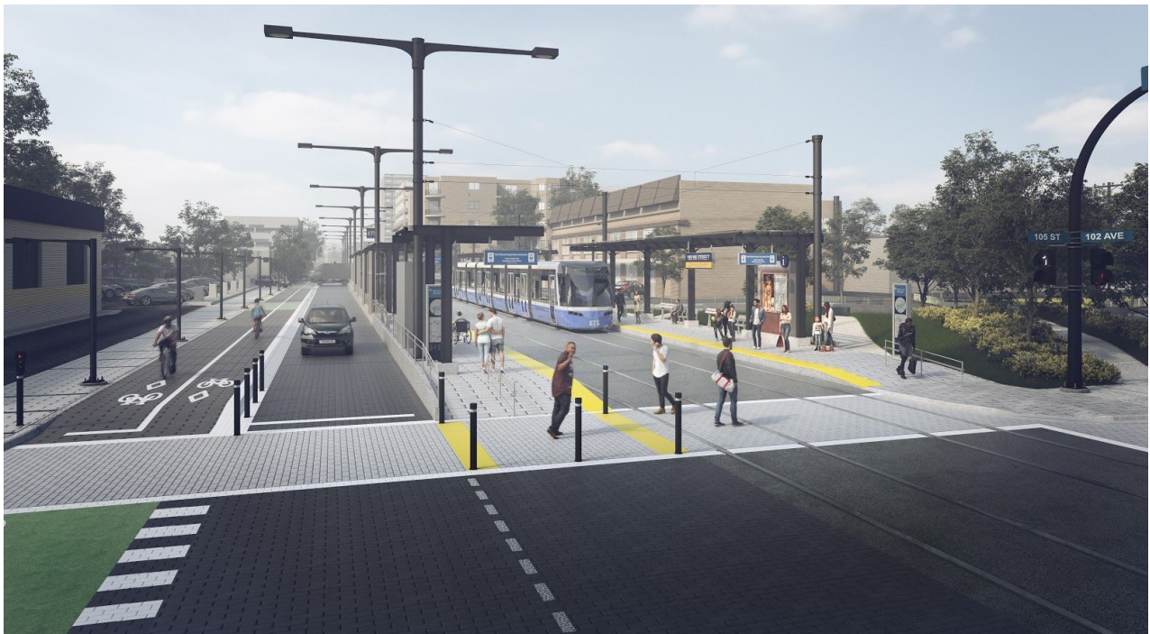
An artist's rendering of the Alex Decoteau Stop

Under the updated preliminary design, the following can be expected: