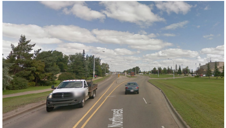
66 Street as it transitions from a two-lane to a four-lane roadway just south of 23 Avenue.