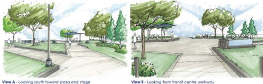
View A - Looking south toward plaza and stage

"Central for events just makes more sense."