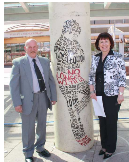
Launch of "No Longer With Us" campaign