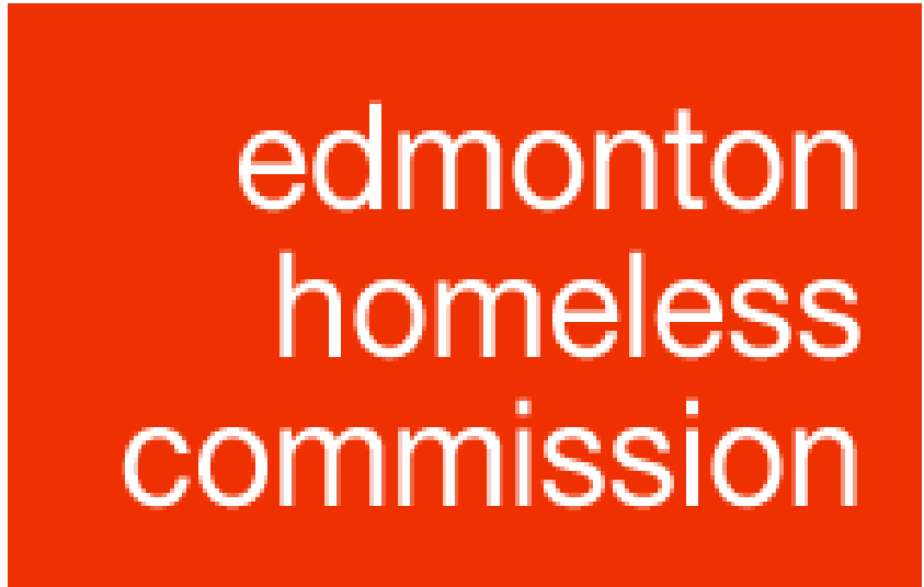
New housing units support former homeless Edmonton residents