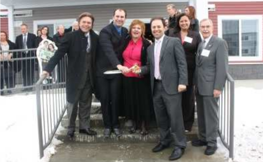
April 5, 2011 Canadian Apartment Magazine