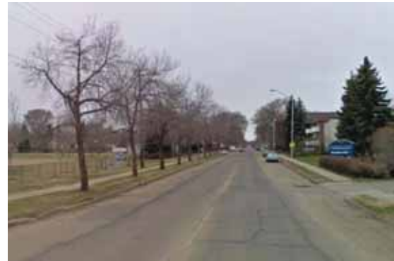
View A - Existing Condition

Note: Cross-section to be confirmed through Preliminary Design.