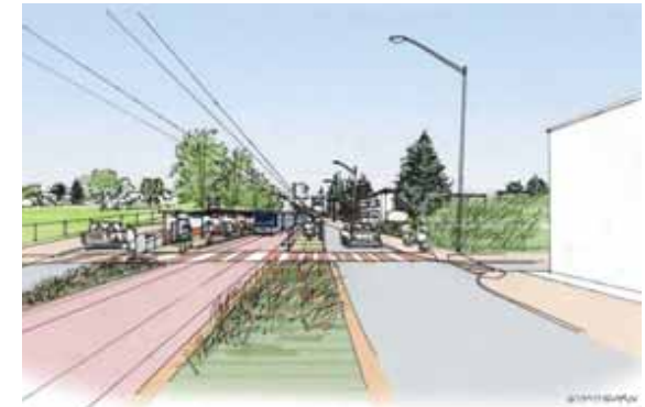
View A - Concept Rendering