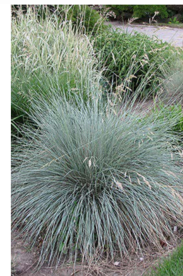
BLUE OAT GRASS