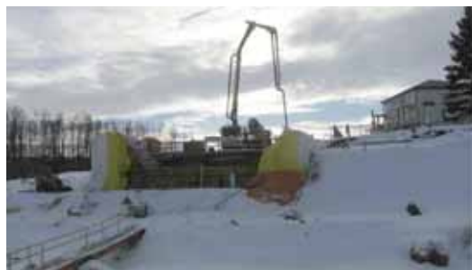
Photo 7: East Abutment Seat Wingwalls Heating and Hoarding After Concrete Pour