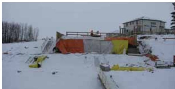
Photo 6: West Abutment Seat Heating and Hoarding After Concrete Pour