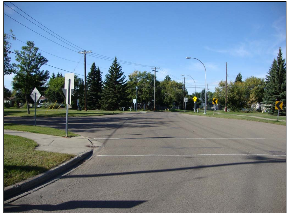
Taken from Google Street, Feb. 2013