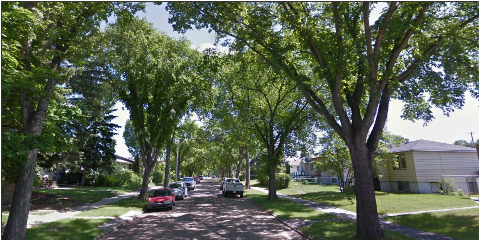
Google Street - Feb. 2013