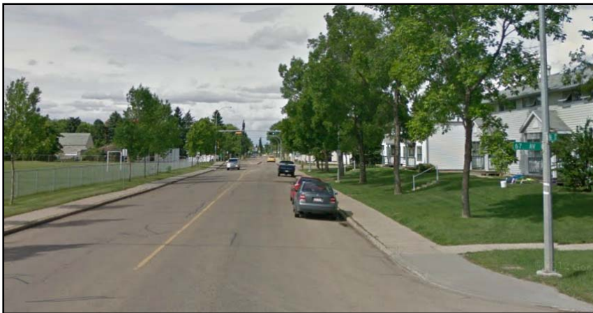
Taken from Google Street, Feb. 2013