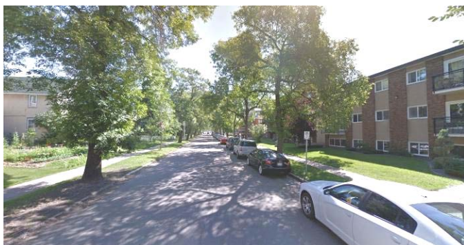
83 Avenue near 105 Street: Before

The majority of the bike route will feature a cycle track design, otherwise known as a protected bike lane, which physically separates motor vehicle traffic from parked cars and sidewalks. It creates a safe cycling environment and minimizes conflicts between cyclists, pedestrians and drivers.