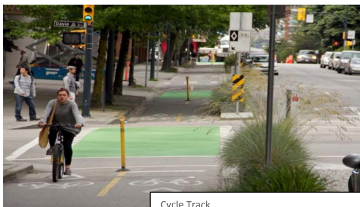
Cycle Track (Example from Vancouver)