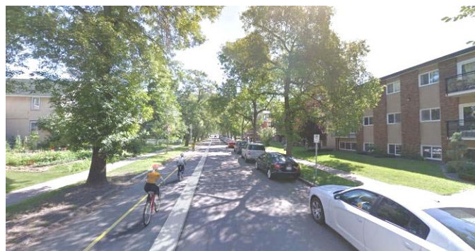
83 Avenue near 105 Street: After

A cycle track will run on the north side of 83 Avenue from 111 Street to 99 Street. From 99 Street to 96 Street, the route will be designed as a bike boulevard and the east end of the bike route will connect to a shared-use path on 95A Street.