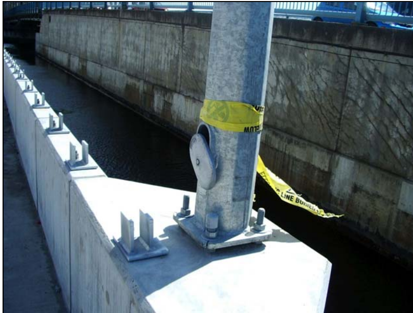
Figure 2 - Example Foundation on Bridge Structure

Foundations for poles shall be designed as part of the bridge structure. Foundations shall be designed to attach to the bridge deck or parapets as shown on Figure 2 below. Foundations and poles shall be placed to allow for clear sidewalk passage.