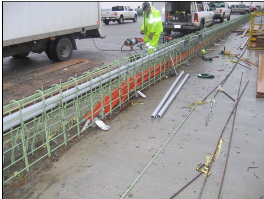
Figure 3 - Example of Conduit on Bridge Structure

Where junction boxes are required, they shall be powder coated aluminum with a NEMA 4 rating and shall be accessible from the bridge deck or sidewalk for easy maintenance.