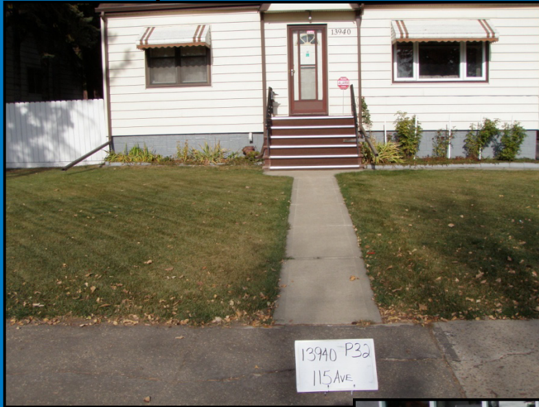
Photo Record of Neighbourhood