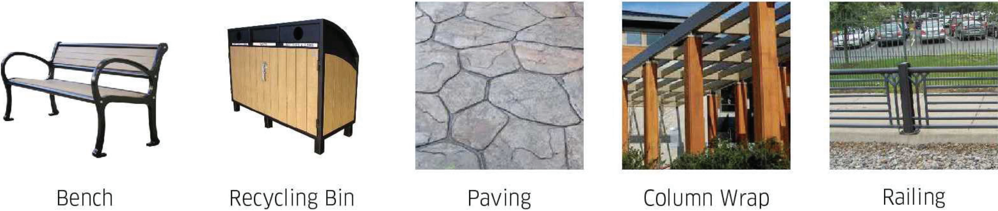
Stop Design Elements (Based on your feedback, elements selected for project will be similar to images above.)