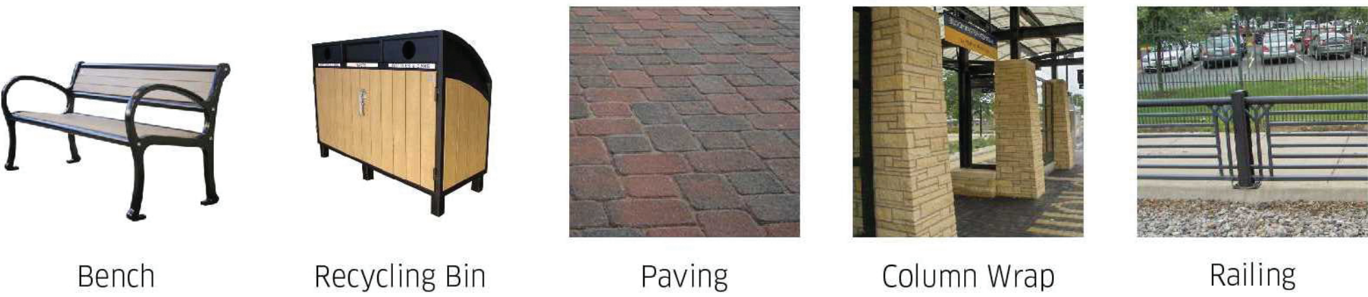
Stop Design Elements (Based on your feedback, elements selected for project will be similar to images above.)