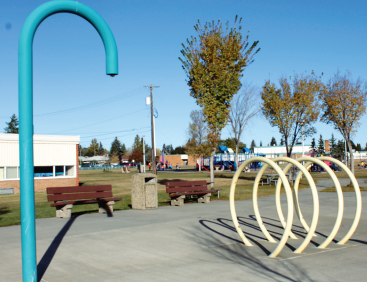
Wellington Spray Deck