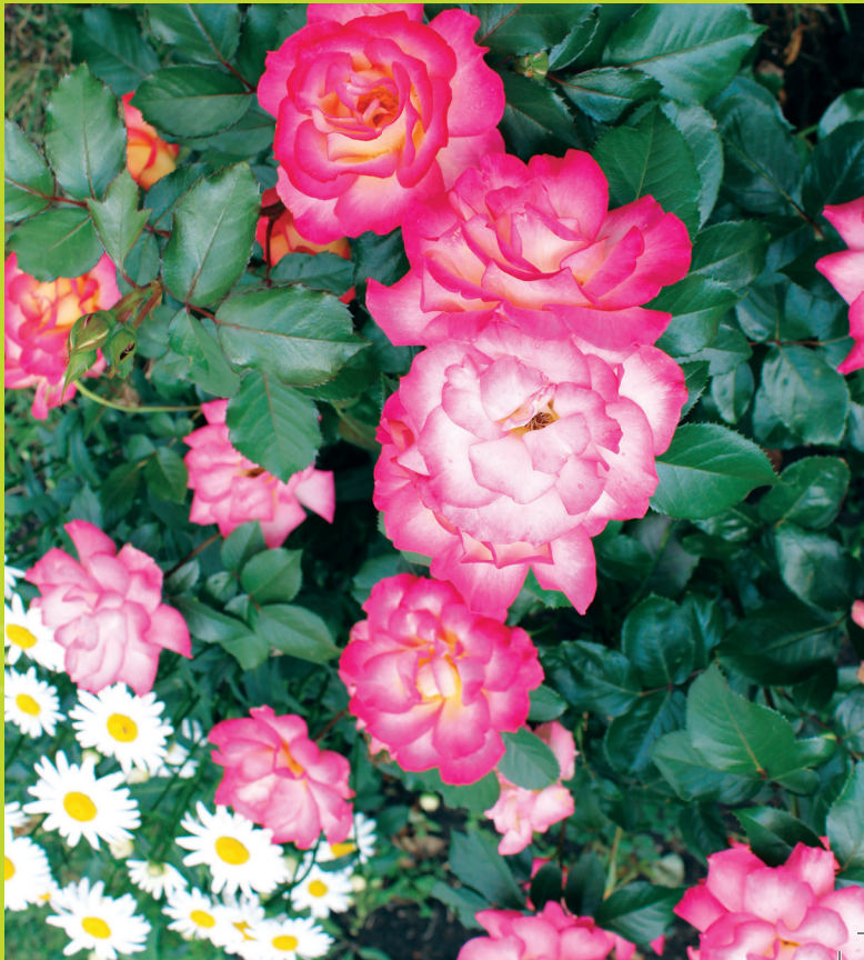
Front Yards in Bloom 2014 entry from Athlone neighbourhood