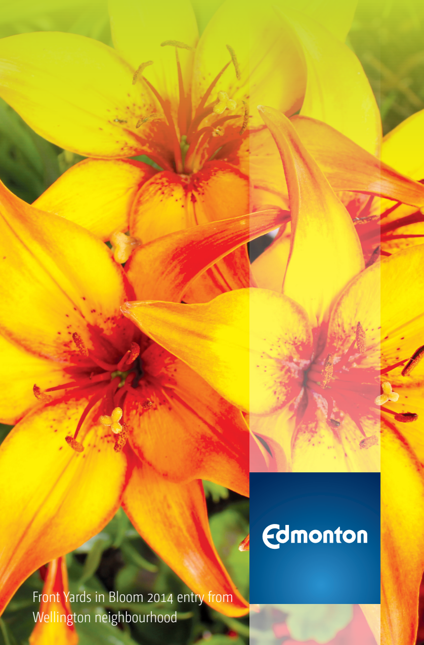
Front Yards in Bloom 2014 entry from Wellington neighbourhood