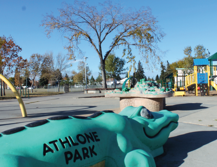
Athlone Spray Deck