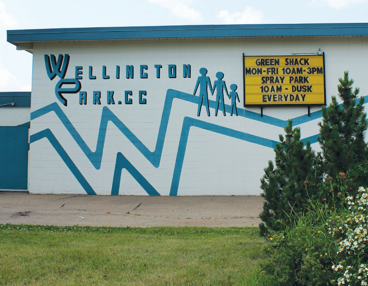
Wellington Park Community League Hall