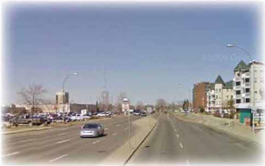
Existing Conditions (Looking north)

(Based on your feedback, elements selected for project will be similar to images above.)