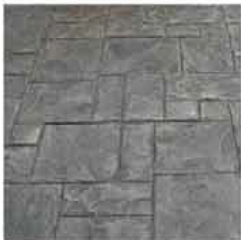
Paving (Patterned Concrete)