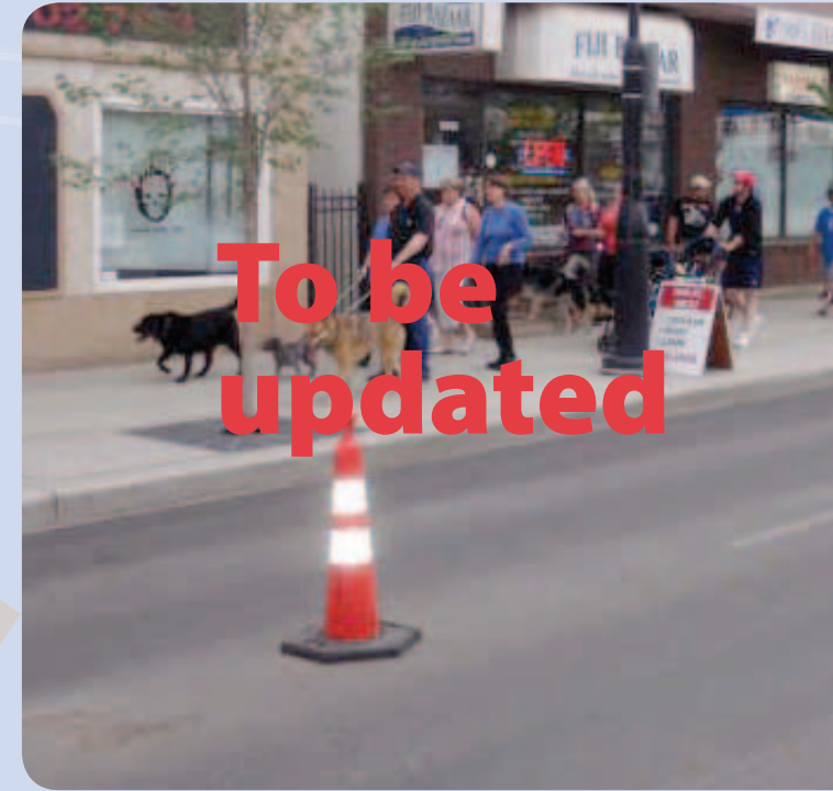
Local dog walking group on 118 Avenue

We would like to hear from you! We would like you to complete a brief survey to get your feedback about this walking map. By completing the survey you will have an opportunity to win either a $100 gift certificate to a local business (early bird prize; draw date August 31, 2010) or a mountain bike and helmet (grand prize; draw date September 30, 2010). For more information about the survey or if you would like a paper copy please phone 780-492-1947.