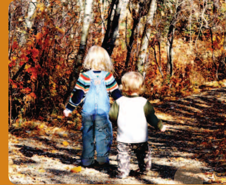
Walk through Kinnaird Ravine