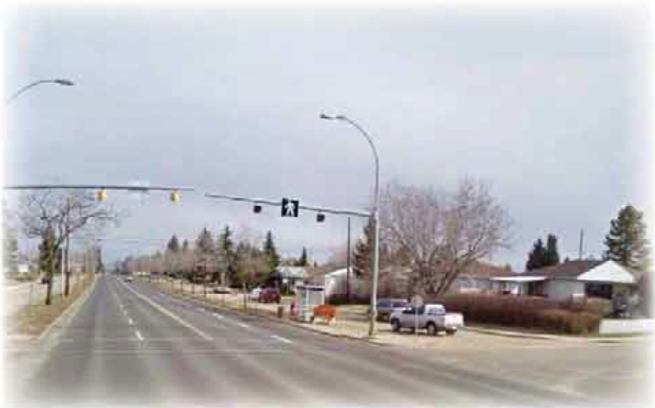
Existing Conditions (Looking north)

(Based on your feedback, elements selected for project will be similar to images above.)