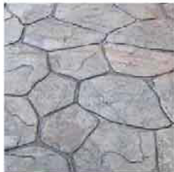
Paving (Patterned Concrete)