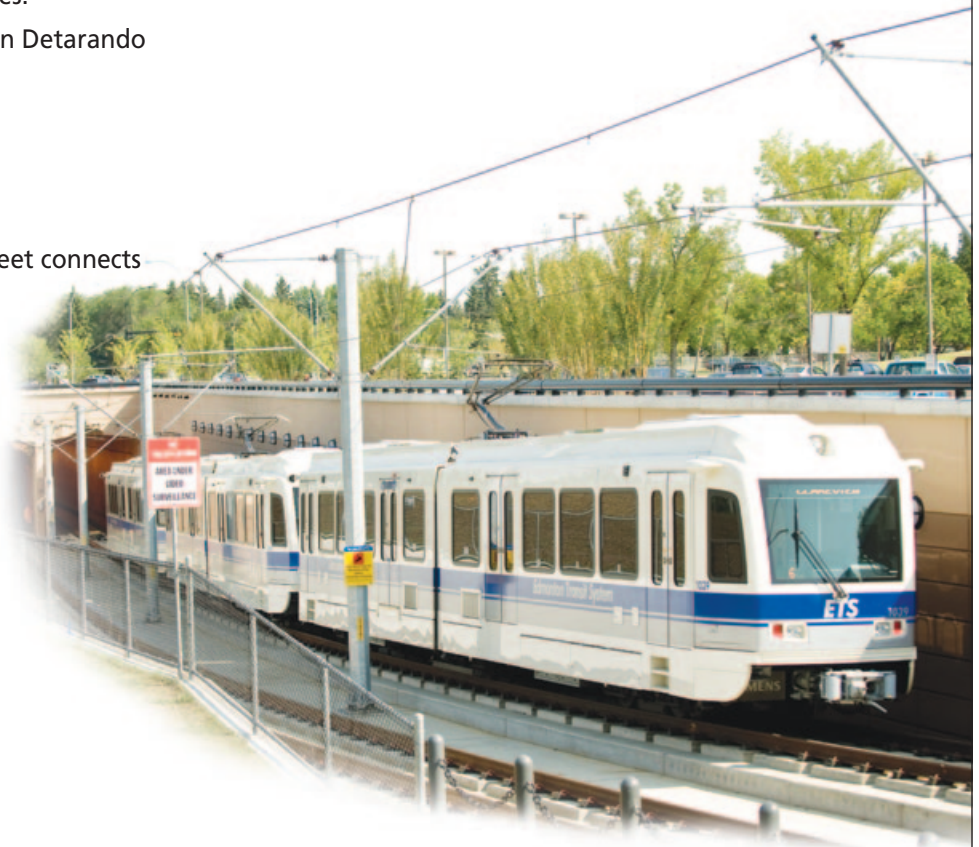
A train enters the tunnel portal at Belgravia Road.