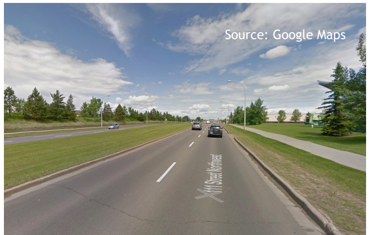
Existing 170 Street - undivided 4-lane rural road