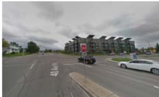
Site-specific considerations: Existing four-way stop intersection.