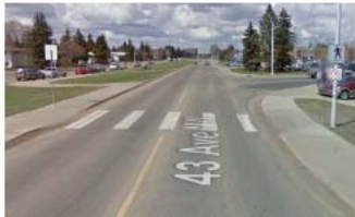
Site-specific considerations: Multiple crosswalks currently exist across 43 Avenue.