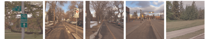
Shared Roadway (currently exists along 114 Street) Protected Bike Lane Bike Boulevard/Painted Bike Lane Raised Bike Lane Shared use Path