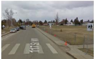
Site-specific considerations: Space for drop-off loop on Edmonton Public School Board land. Dependent on drop-off funding availability.