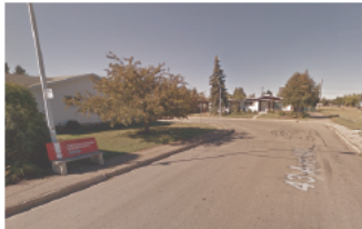
Site-specific considerations: Future bus stop locations are contingent on the Bus Network Redesign.