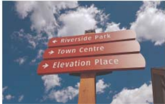
Site-specific considerations: Sign design and location selection considerations.