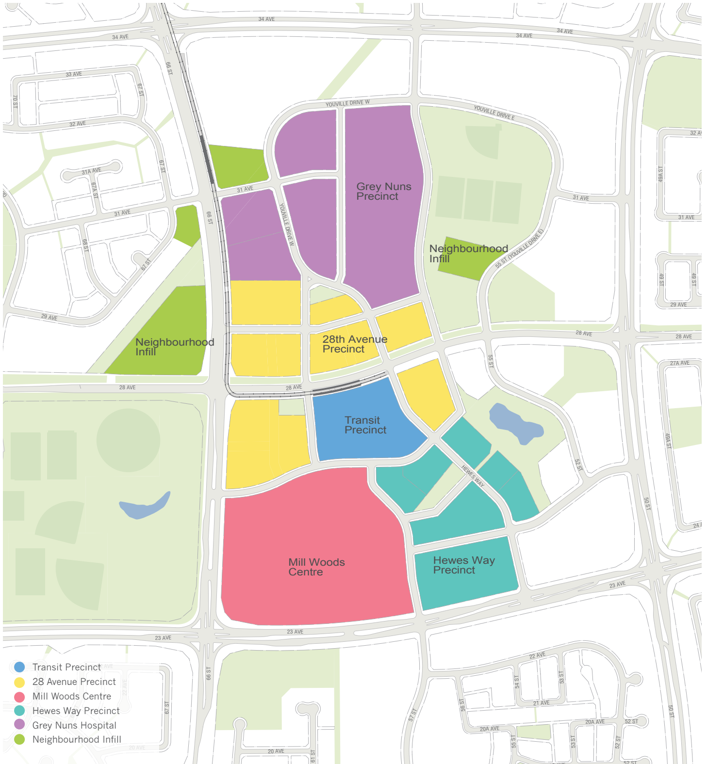
Land Use Precincts