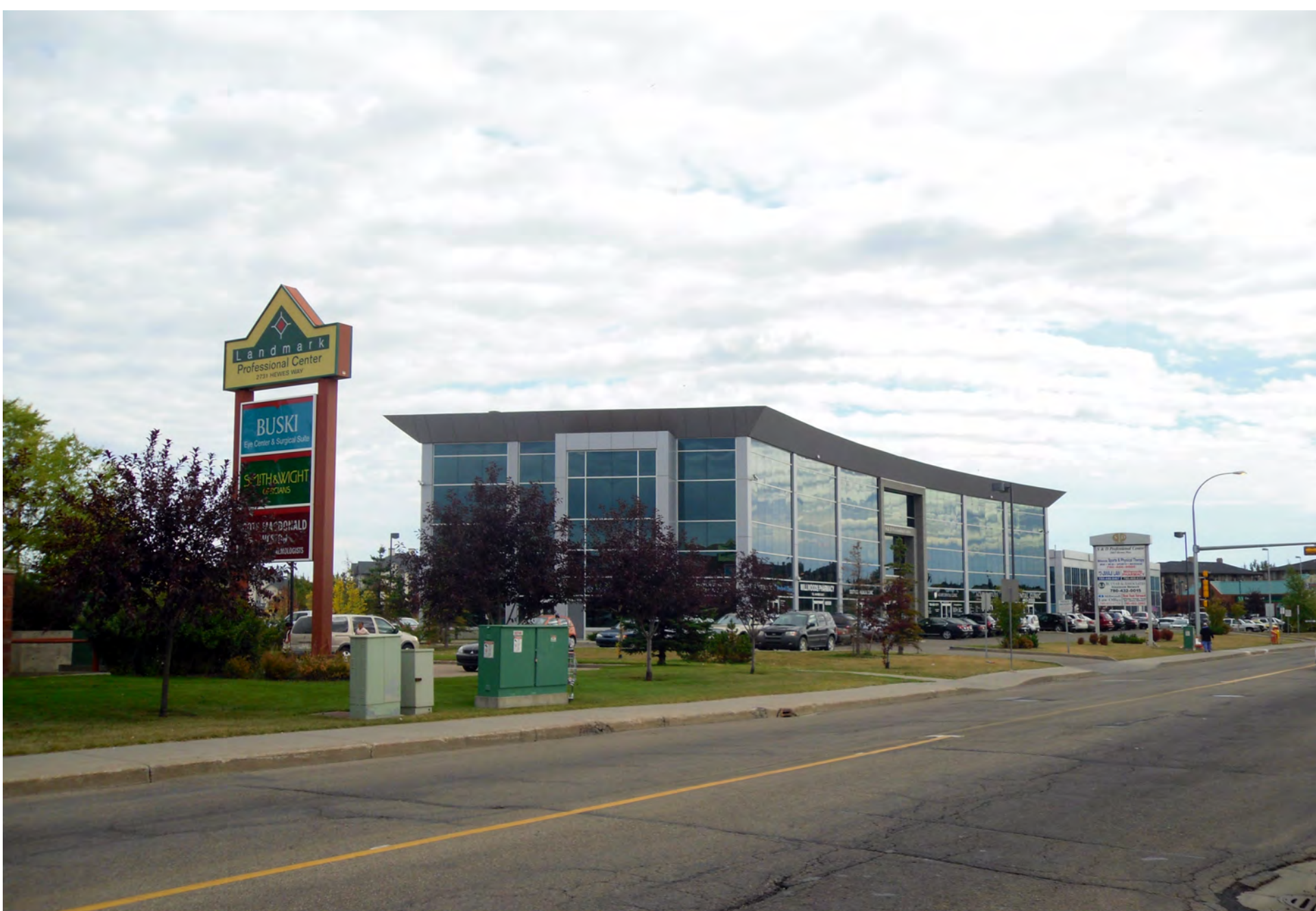
Mill Woods - Landmark Professional Centre