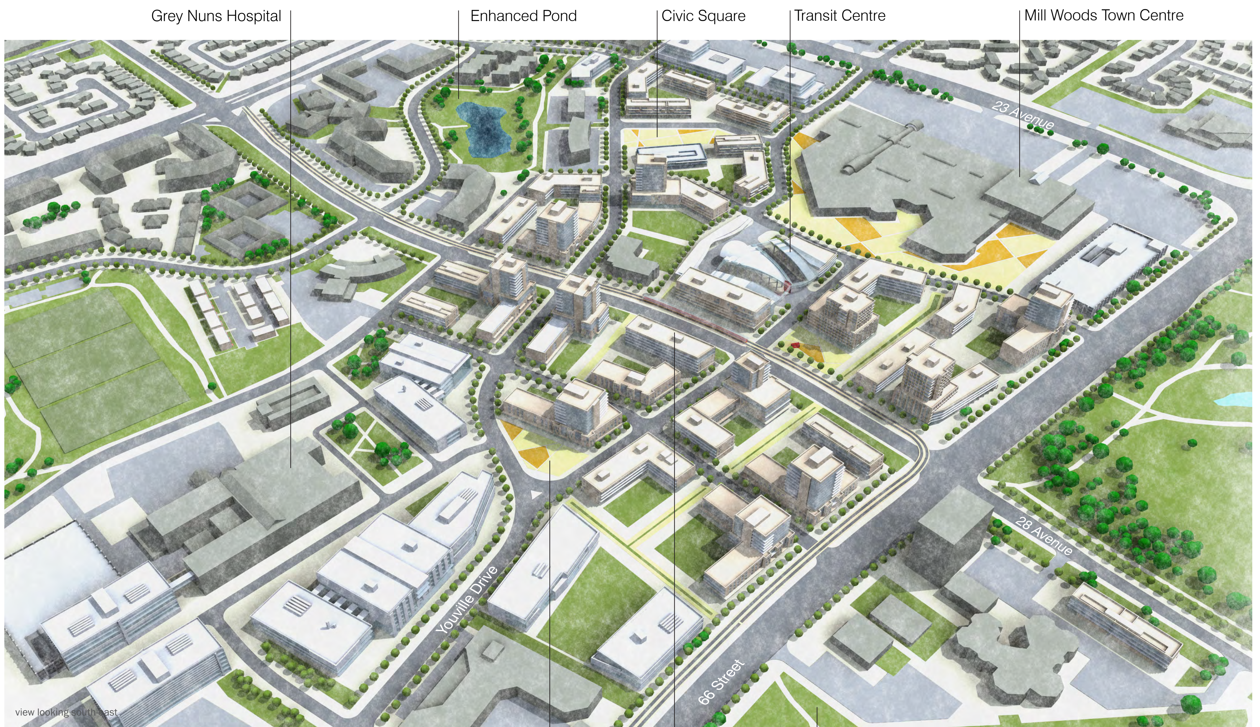
Development Concept Illustrated

An important element of the new urban grid is the creation of a north-south mixed use main street. The construction of the LRT line will allow for the redesign of 28 Avenue as a pedestrian friendly, mixed use main street with a wide generous public realm that is well integrated with the LRT Station and Transit Centre.