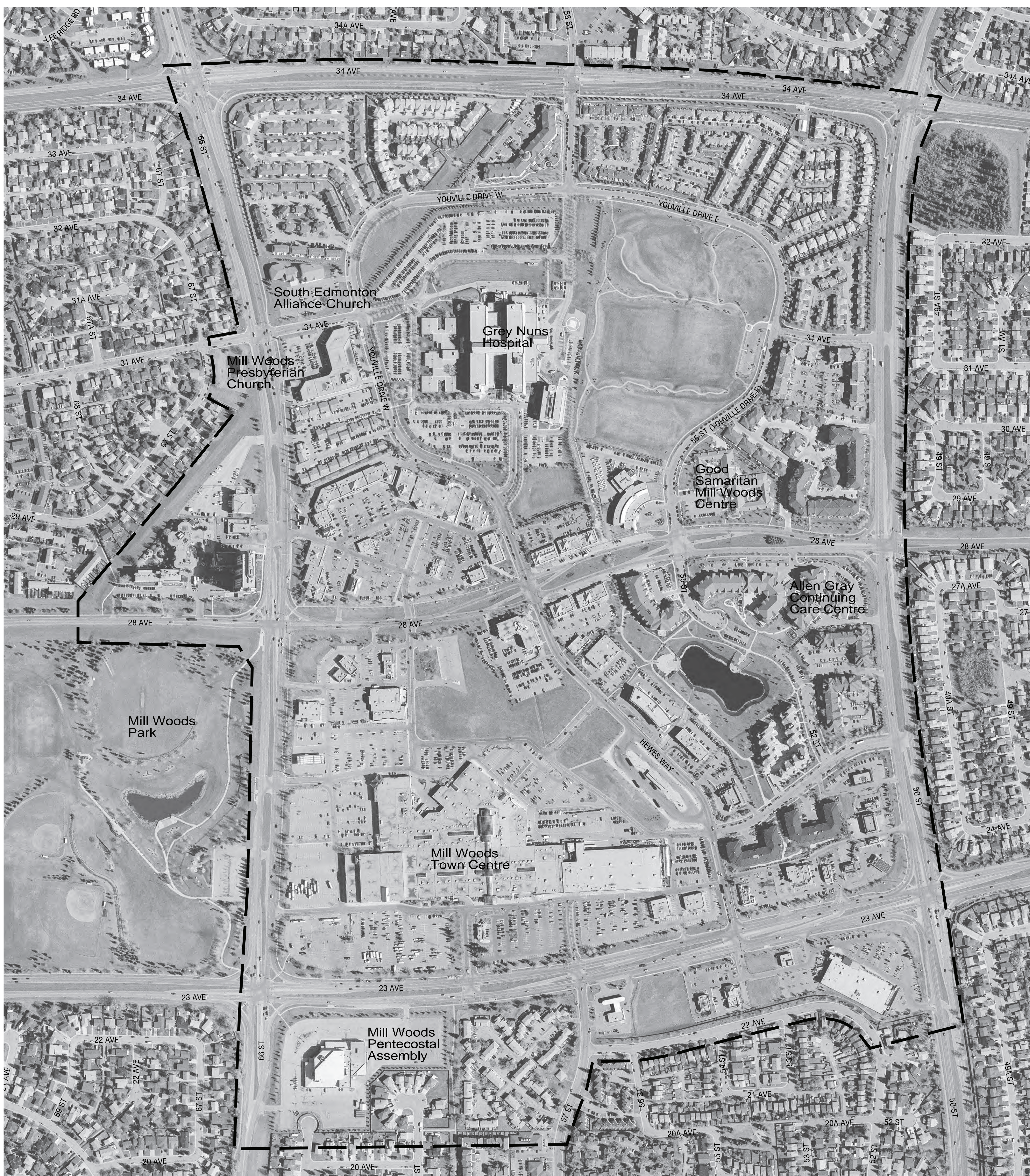
The Plan Boundary