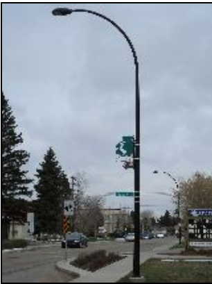
Powder coated galvanized