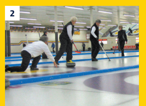
2 Thistle Curling Club, 6920 – 114 Avenue The Thistle Curling Club is the oldest in Edmonton. Founded in 1920, the club has been in the Bellevue location since 1952. The Thistle hosts youth and adult leagues, and proudly hosts championship tournaments.