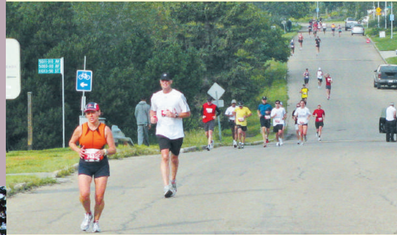
Marathon on Ada Boulevard