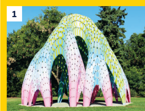
1 "Willow", public art at Borden Park Borden Park is a popular summer destination with beautiful mature trees, a new playground, refurbished bandshell, fountains, walkways and picnic shelters. This gem is also home to Edmonton's first Sculpture park, with 11 temporary sculptures that will rotate every 2 years.