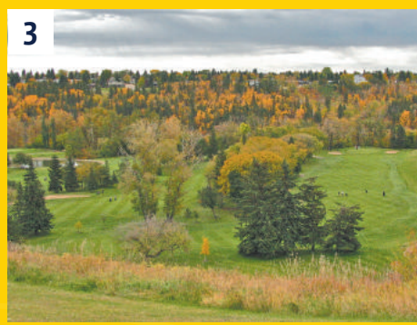
3 Highlands Golf Club The Highlands Golf Club was established more than 80 years ago in the Highlands and Bellevue communities. In the winter months, the course is popular with dog-walkers and area residents who ski, snowshoe and sled down hills.