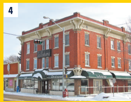
4 6423 – 112 Avenue (1913) Gibbard Block The historic Gibbard Block, home to La Bohème Restaurant, is a prominent architectural feature of the Highlands business district.