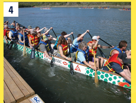
Dragon Boat Dock