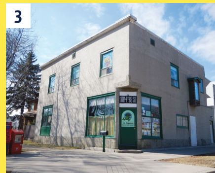
Tree Frog Corner