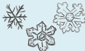
Stellar Dendrites & Plates