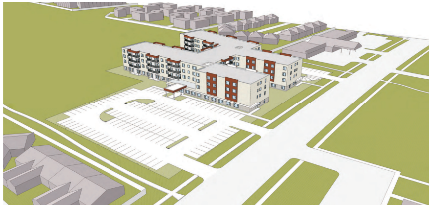
VIEW FROM NORTH EAST