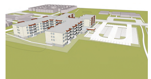
VIEW FROM SOUTH EAST