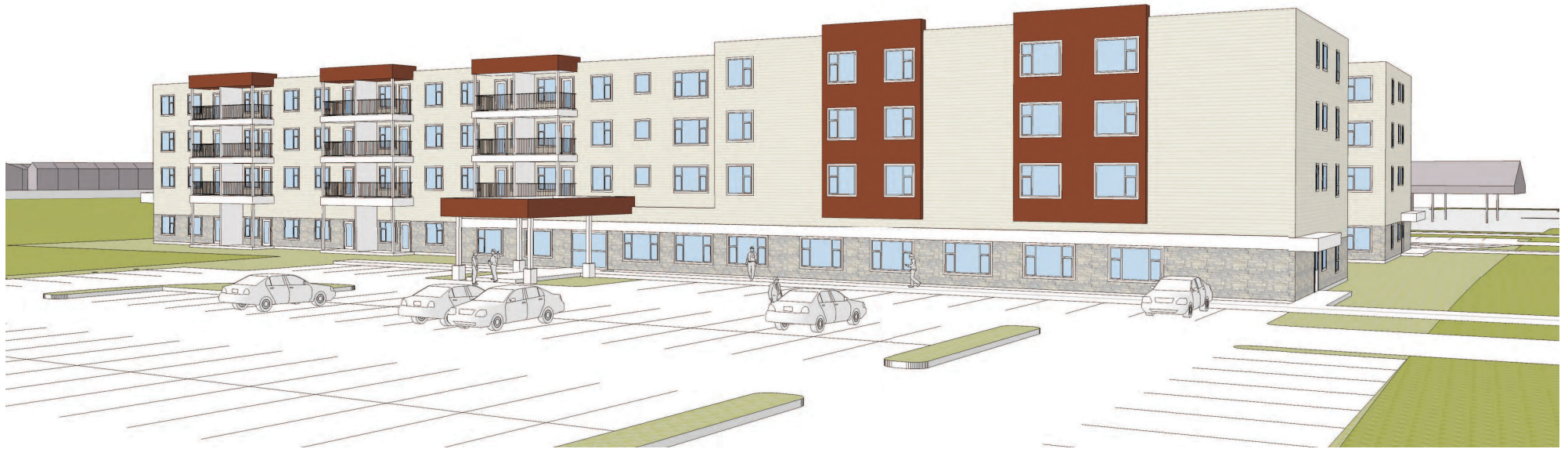
MAIN ENTRANCE ELEVATION