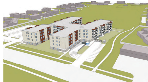
VIEW FROM NORTH WEST