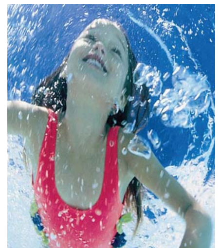
Aquatic Leisure Facility