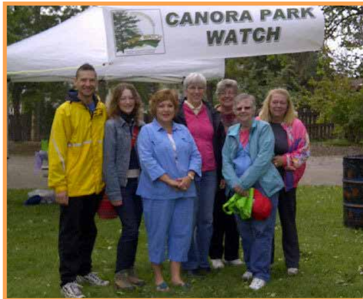
Canora Park Watch Group, left to right: