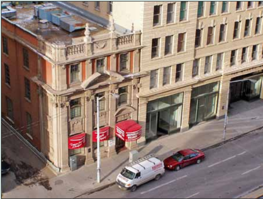
View of the Canada Permanent Building c. 1980.