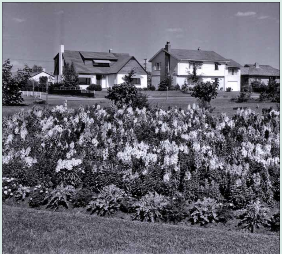
Landscaped flower beds in Windsor Park in 1958 looking towards Windsor Road.

For the next 40 years, the “park-like circle” lay dormant, a “bare, grassy area” according to one laconic