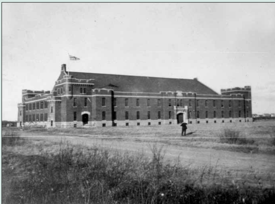
A man stands in front of the Armouries ca. 1915 in one of the archives’ earliest photos of the building.