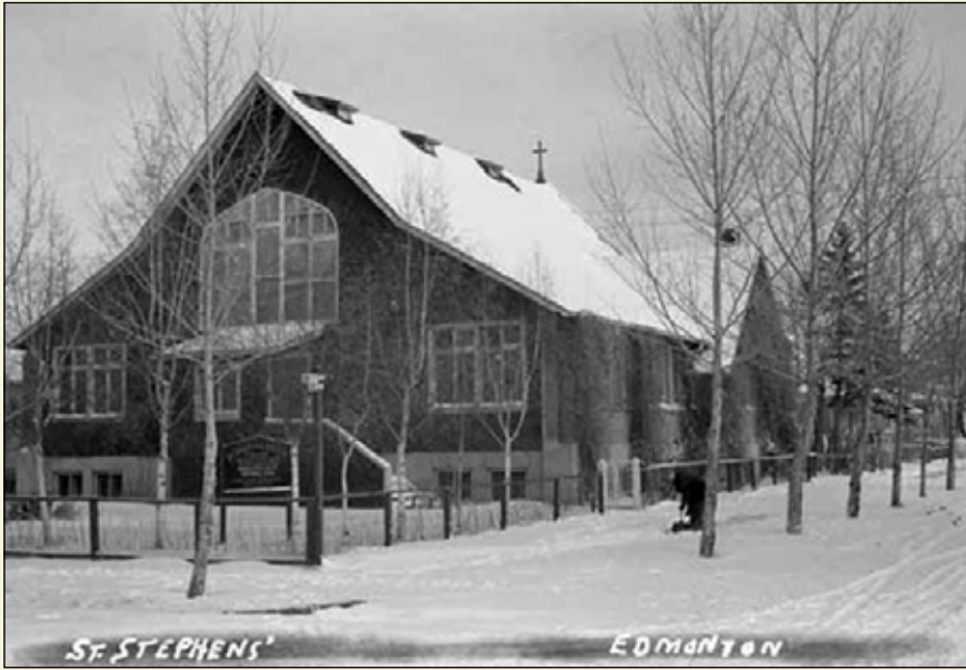
View of St. Stephen the Martyr Anglican Church c. 1940.