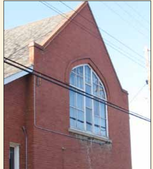
View of the rear façade in 2010 before the removal of the windows.

Tudor period specifically architecture of the English countryside between the year 1485 and 1547. Tudor Revival focuses on 'simple rustic' and less impressive aspects of Tudor architecture imitating medieval cottages and country homes in particular. Throughout Canada, Tudor revival architecture is most commonly applied to small residential architecture from about 1900. This is a rare example of its application to religious buildings.