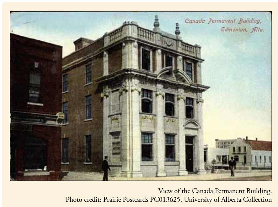
View of the Canada Permanent Building.

The Canada Permanent Building has survived multiple owners, a use transi-