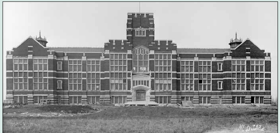
John A. McDougall School after construction in 1914.