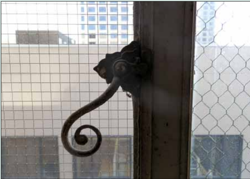
View of Decorative Handles on Steel Frame Windows, 2012.

of the insurance building remain. These include the original art nouveau inspired balustrade, the steel frame windows with locking decorative handles and some small fragments of crown moldings and coffered ceilings.