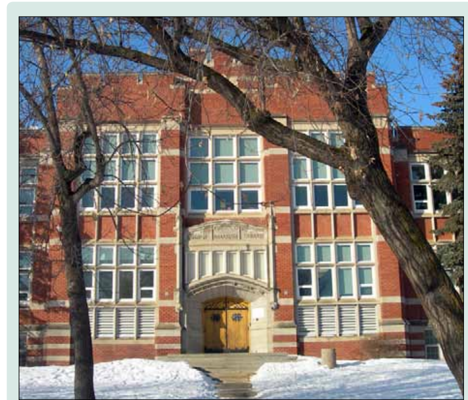
Front entrance of John A. McDougall School in 2010.