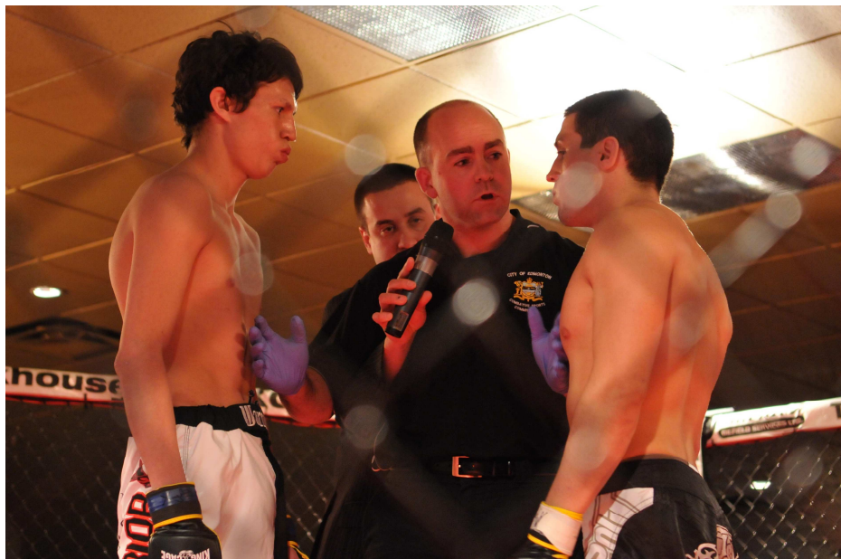
"ECSC referee informs combatants of the rules."

Action and Timeframe: The Code needs clarification on combative sports (it is out of date). We can recommend wording based on ECSC legal minds to the Justice Committee of the federal government as soon as possible.