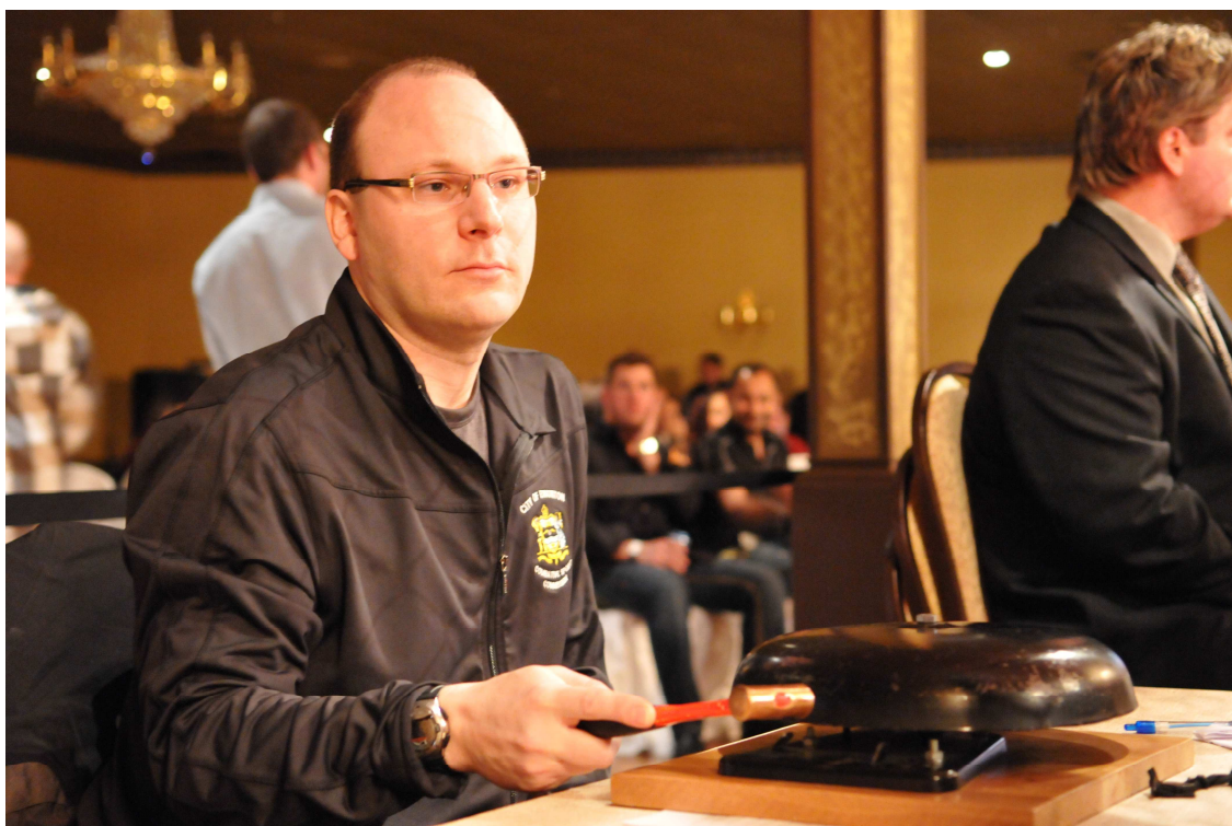
"ECSC timer signals the end of the round"