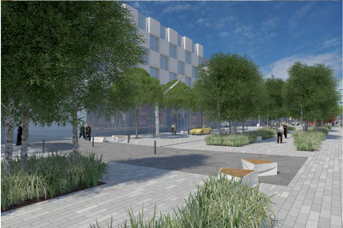
TOP: view from mid-block between 102 Avenue and 102A Avenue looking southeast BOTTOM: view of mid-block north of 102A Avenue looking northwest