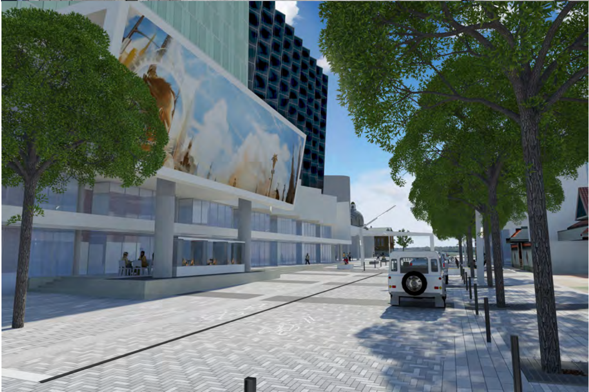
TOP: view from Jasper Plaza looking northeast to hotel retail frontage BOTTOM: view from 102 Avenue looking South to Hotel Terrace, Jasper Avenue and the River Valley