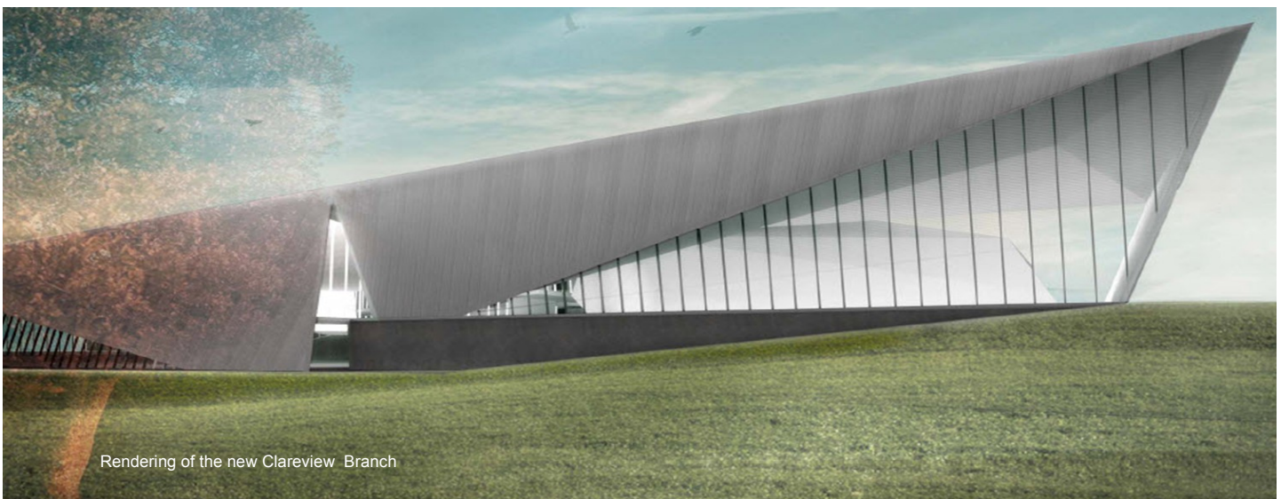
Rendering of the new Clareview Branch

EPL's innovation in service delivery has made it a recognized leader across Canada and internationally. EPL acknowledges the need to provide value to its customers and continually looks for innovative and sustainable ways to fund library services.