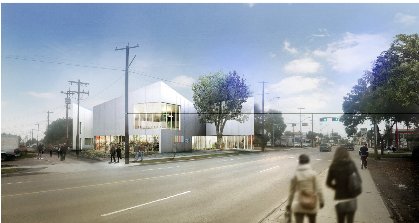
Rendering of the new Highlands Library Branch

Increase of 1.5 FTE's are related to new Read. Talk. Play. Share. (0.5 FTE's) and Maker Space (1.0) services in the 2013 Budget.