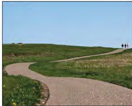
Typical Major Looping Pathways