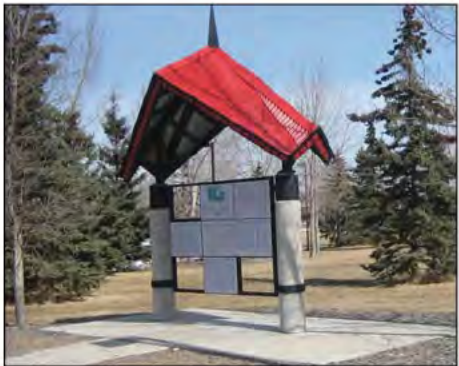
Trans Canada Trail Kiosk