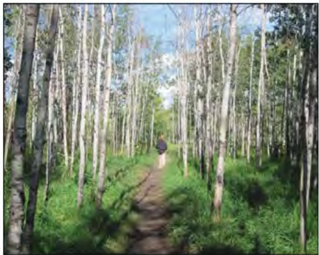
Existing Informal Pathway