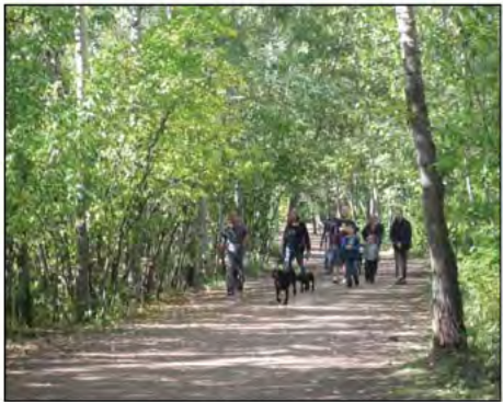
Existing Riverside Pathway

Secondary/Informal/ Riverside Pathways Existing pathways onsite left in current condition without improvements.