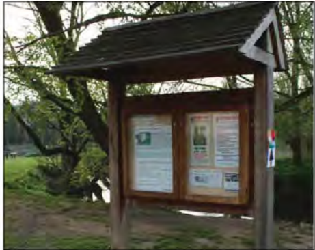
Typical Information Kiosk