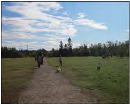
Existing Secondary Pathway