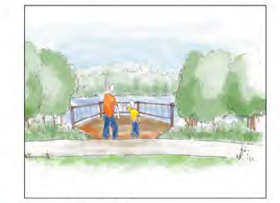
Riverside View Point